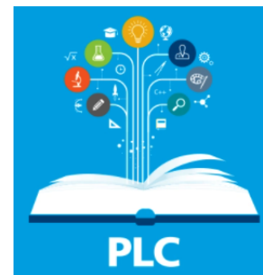
Buljan is a PLC school

Positive Behavioral Interventions and Supports (PBIS) is an evidence-based three-tiered framework to improve and integrate all of the data, systems, and practices affecting student outcomes every day. PBIS creates schools where all students succeed.